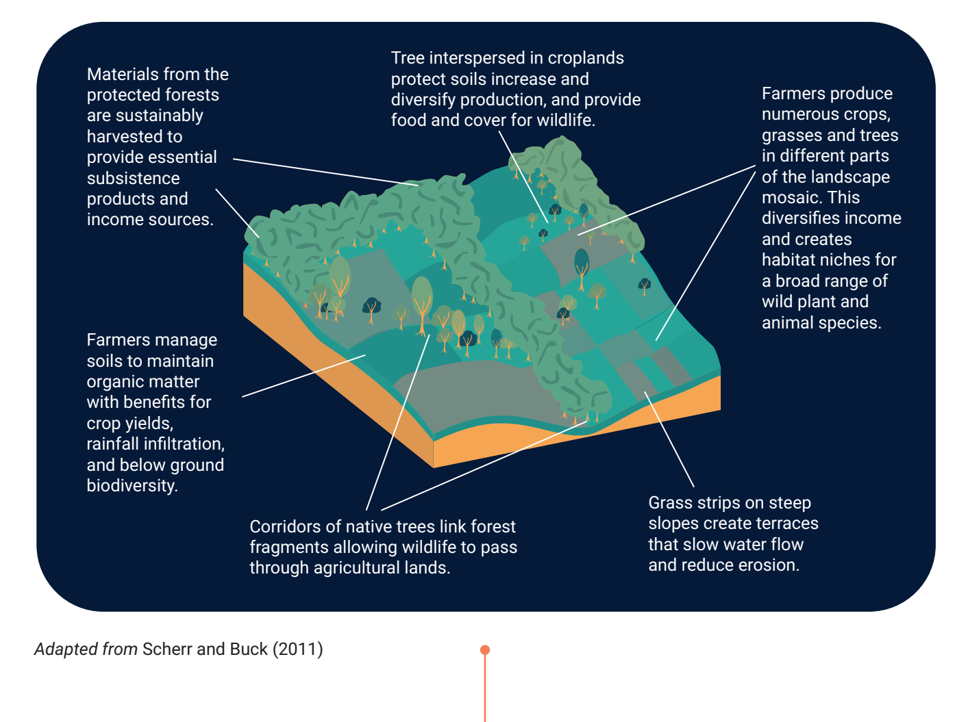
Figure 1: Ecological corridors and farms

Maintain organic matter, use cover crops in harvested areas and avoid use of heavy machinery to prevent soil compaction, thereby ensuring infiltration and water-storage capacity.