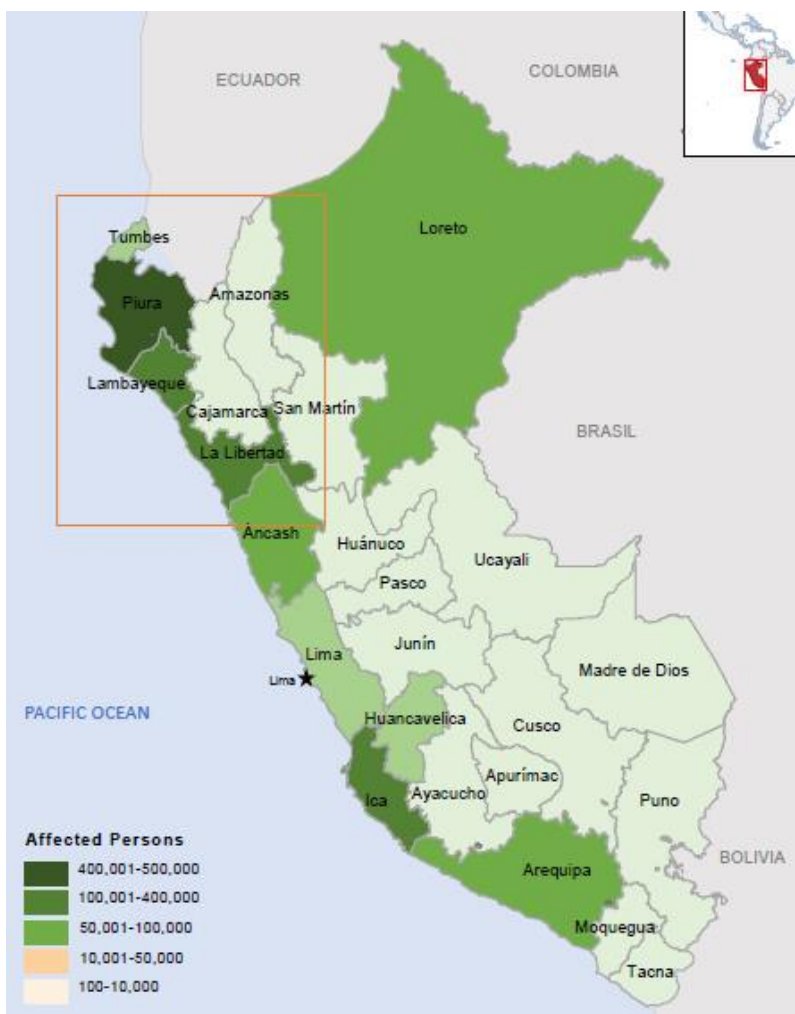
Map of affected area: 7 April 2017

WASH continues to be the main issue facing the affected areas with over 567,000 people in need of water, sanitation and hygiene interventions including access to drinking water and sanitation facilities, excreta disposal and encouraging the practice of basic hygiene habits in order to prevent the spread of disease. In Piura there are reports of many children and families suffering from respiratory problems and other diseases directly attributable to the emergency; while Zika, Chikungunya and Dengue remain a concern. According to the Health Regional Office of Piura, there are seven Dengue-related deaths registered in 2017.